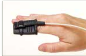
SenSmart 8100SM Medium

Digit thickness: 10mm to 19mm (0.4in to 0.75in) Preferred application: Fingers