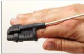
SenSmart 8100SL Large

Digit thickness: 12.5mm to 25.5mm (0.5in to 1in) Preferred application: Fingers