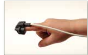
SenSmart 8100SS Small

Digit thickness: 7.5mm to 12.5mm (0.3in to 0.5in) Preferred application: Fingers