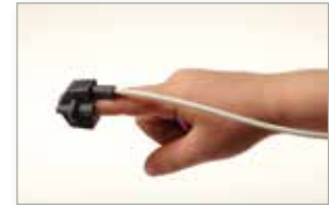
SenSmart 8100SS Small

Digit thickness: 7.5mm to 12.5mm (0.3in to 0.5in) Preferred application: Fingers